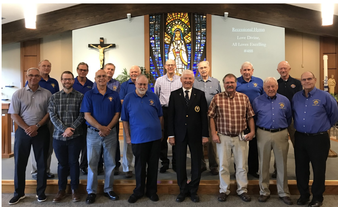
First Corporate Communion for the Fraternal Year of 2022-2023. Thanks to all the Knights who got up early and made it to St. Mary's 8:00am mass! We are a good-looking bunch!!!!