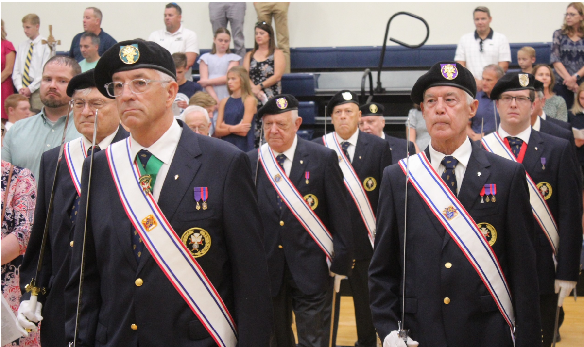
Honor Guard at Fr McGivney HS 10th Anniversary celebration

If you are a member of the 4th Degree please consider getting the regalia. We are in need of more members with regalia. The Assembly will reimburse you 50% of the cost of the regalia. If you are not a member of the 4th Degree, please consider becoming a 4th Degree Knight.