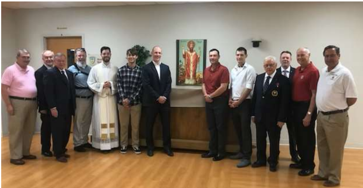
An Exemplification for new members was held after the May 4th Corporate Communion . Congratulations to the new members .